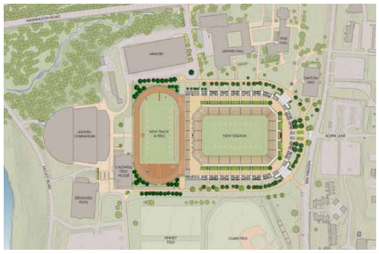
This layout shows the relationship among the various structures, including the perimeter borseshoe-shaped building, the seating sections on three sides above the field-level bowl seating, the track stadium (center) and the gymnasium (left).

cast as a series of flat facets in a single panel.