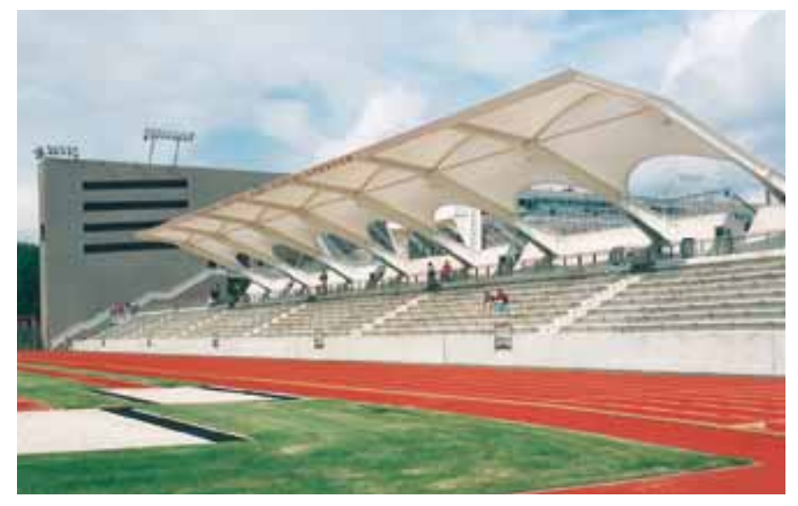
The adjoining track stadium features precast concrete seating covered with a fabric canopy beld in place by cantilevered steel posts. The units are monolithic with precast concrete seating facing the other direction to enclose the open end of the football field's seating.

and bolted into position. C&C Erectors Inc. in Woodbury, N.J., performed the erection on all precast components while Concrete Structures Inc. in Richmond, Va., on a subcontracted basis through Metromont, produced the raker beams and wing beams.