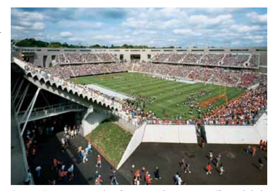
Princeton University's new stadium features several unique aspects. These include the trapezoidal upper seating on three sides, made of precast concrete triple risers, and a perimeter building housing all services that remains open year-round, as does the colonnade behind the seating sections.

while executing that design with modern architectural and structural techniques."